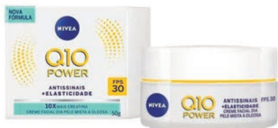
F.T.CR.NIVEA ANTI.Q10 DIA P.MIS./OLE.52G 4005808174478