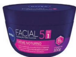
F.T.CR.NIVEA NOTURNO 100G 42389248