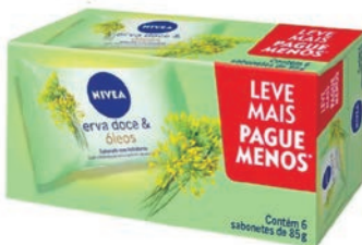
SAB.NIVEA*ERVA DOCE 85G LEV+PG- C/6 4005900739346