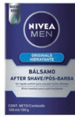
BAR.NIV.AFT.SHAVE HIDRATANTE 100ML 8412300813006