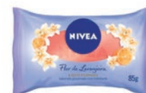
SAB.NIVEA*FLOR DE LARANJEIRA 85G 4005900696830