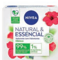
SAB.NIVEA* BARRA NATURAL HIBISCO 90G 4005900909794