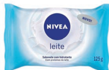
SAB.NIVEA*LEITE 125G 4005900742407