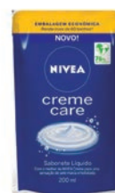
SAB.LIQ.NIVEA REFIL CREME CARE 200ML 4005900734082