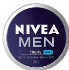
CR.NIVEA LATA MEN 4EM1 30G 42355465