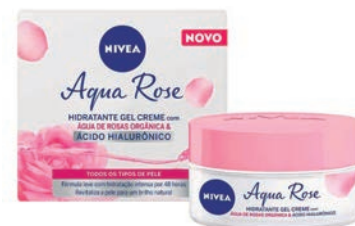
F.T.CR.NIVEA AQUA ROSE GEL C/A. HIAL.50ML 4005900894779