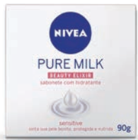
SAB.NIVEA* BARRA PURE MILK SENSITIVE 90G 4005900807854