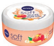
CR.NIVEA HIDRATANTE SOFT PEACH POTE 97G 4005900906489