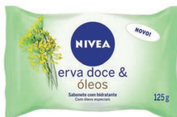
SAB.NIVEA*ERVA DOCE 125G 4005900742414