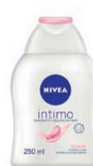
SAB.NIVEA INT.SUAVE 250ML 7890704810516