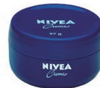
CR.NIVEA HIDRATANTE POTE 97G 7891177801308