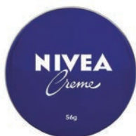
CR.NIVEA LATA 56G 78906617