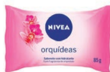
SAB.NIVEA*ORQUIDEAS 85G 4005900522016