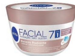
F.T.CR.NIVEA PELE NEGRA 100G 4005900950987