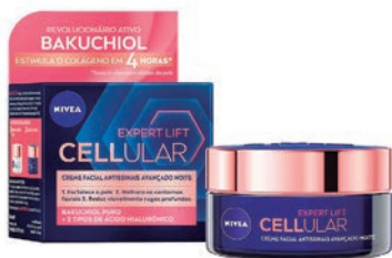
F.T.CR.NIVEA CELL.EX.NOITE BAKUCHIOL 50G 4005900929686