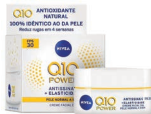
F.T.CR.NIVEA ANTI.Q10 DIA P.NOR./ SEC.52G 4005808812875