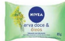
SAB.NIVEA*ERVA DOCE 85G 4005900521934