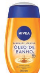
SAB.NIVEA LIQUIDO NAT.OIL P/BANHO 200ML 4005808808281