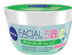
F.T.CR.NIVEA GEL FRESH 100G 42398004