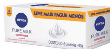
SAB.NIVEA* BARRA MILK SENS.90G L+P- C/6 4005900810885