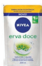
SAB.LIQ.NIVEA REFIL ERVA DOCE 200ML 4005900734075