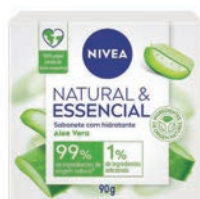
SAB.NIVEA* BARRA NATURAL ALOE VERA 90G 4005900909800