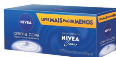
SAB.NIVEA* BARRA CREME CARE 90G L+P- C/6 4005900701367