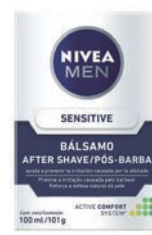
BAR.NIV.AFT.SHAVE SENSITIVE 100ML 8715200813061