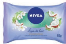
SAB.NIVEA*AGUA DE COCO 85G 4005900696847