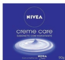
SAB.NIVEA* BARRA CREME CARE 90G 4005900294722