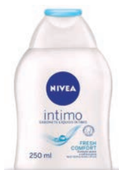
SAB.NIVEA INT.FRESH 250ML 4005900219626