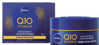
F.T.CR.NIVEA ANTI.Q10 NOITE 50G 4005808812899