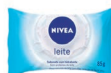
SAB.NIVEA*LEITE 85G 4005900521910