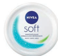
CR.NIVEA HIDRATANTE SOFT POTE 97G 4005808890590