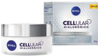
F.T.CR.NIVEA CELL.ANTI.FPS30 DIA 51G 4005900139849