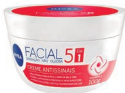
F.T.CR.NIVEA ANTISSINAIS 100G 42360414