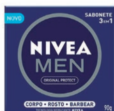
SAB.NIVEA* BARRA F.M ORIGINAL 3X1 90G 4005900380982