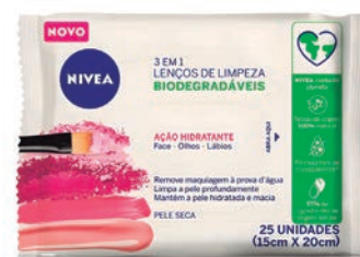
F.L.LENCO LIMP.NIVEA 3EM1 HIDRAT.25UN 4005808561162