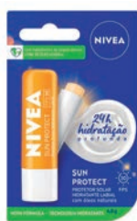
PROT.LAB.NIVEA LIP CARE SUN FPS30 4,8G 7890704851335