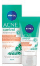
F.T.CR.HIDR.NIVEA ACNE CONTROL 50G 4005900945693