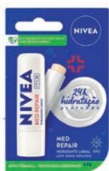
PROT.LAB.NIVEA LIP CARE MED.PROTEC- T4,8G 4005808369621