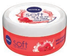
CR.NIVEA HIDRATANTE SOFT ROMA POTE 97G 4005900906557