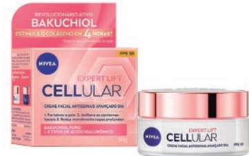
F.T.CR.NIVEA CELL.EX.DIA BAKUCHIOL 50G 4005900929679