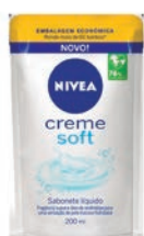
SAB.LIQ.NIVEA REFIL CREME SOFT 200ML 4005900734068