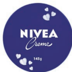
CR.NIVEA LATA 145G 4005900408891