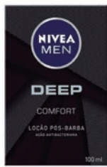
BAR.NIV.AFT.SHAVE DEEP BLACK 100ML 4005900648419