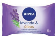
SAB.NIVEA*LAVANDA 85G 4005900521972