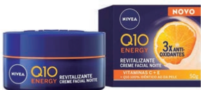
F.T.CR.NIVEA ANTI.Q10 ENERGY VIT.C 50G 4005900779458