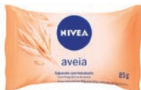
SAB.NIVEA*AVEIA 85G 4005900521897