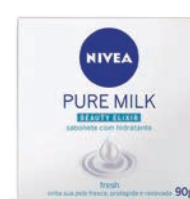
SAB.NIVEA* BARRA PURE MILK FRESH 90G 4005900807861