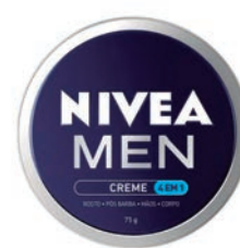
CR.NIVEA LATA MEN 4EM1 75G 4005900442659