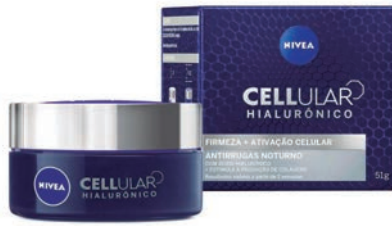
F.T.CR.NIVEA CELL.ANTI.NOITE 51G 4005900139856