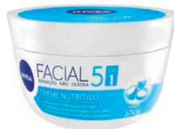
F.T.CR.NIVEA NUTRITIVO 100G 42360407