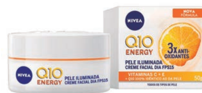
F.T.CR.NIVEA ANTI.Q10 DIA PLUSC 51G 4005900079664