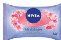
SAB.NIVEA*FLOR DE CEREJEIRA 85G 4005900696823