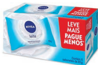
SAB.NIVEA*LEITE 85G LEV+PG- C/6 4005900713612