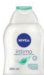
SAB.NIVEA INT.NATURAL 250ML 7890704808131