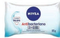
SAB.NIVEA*ANTIBACTERIANO 3X1 85G 4005900916129