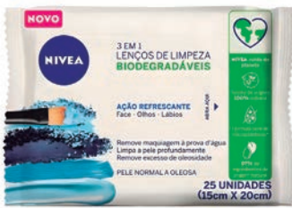
F.L.LENCO LIMP.NIVEA 3EM1 RE-FRESC.25UN 4005808811212